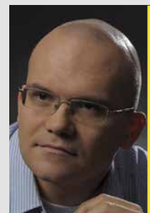
Raul Pop Ecoteca